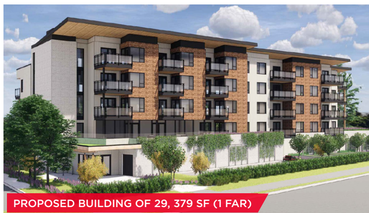
PROPOSED BUILDING OF 29, 379 SF (1 FAR)